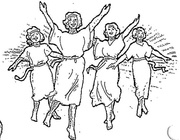
Group of Angels