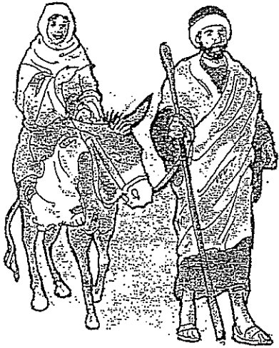
Mary (on the Donkey) and Joseph